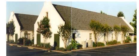
Lafayette and Morgan City, LA